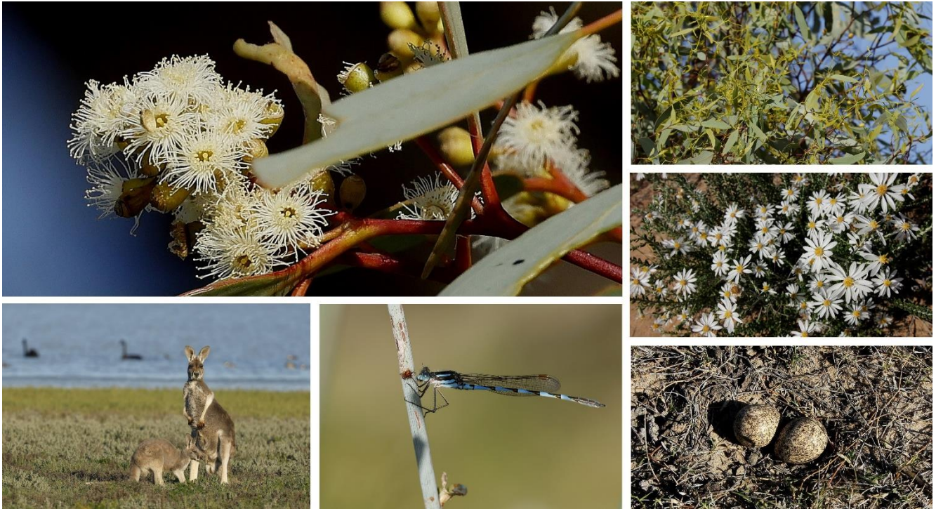
Left to right, clockwise: 1. Black box flowering. 2. Black box. 3. Daisy. 4. Dotterel Black-fronted eggs. 5. Blue ringtail damselfly. 6. Red Kangaroo.

DEW ecologists have started gearing up for another busy field season monitoring the wonderful fauna and flora that occupies the wetlands and floodplains.